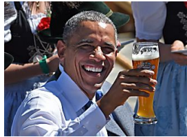
Each U.S. President's Drink of Choice InsideGov