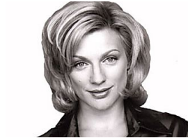
Bill Clinton Affair with Vice President's Daughter: REVEALED LifeDaily