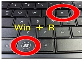
1 Reason To Do This Every Time You Use A Computer Smarter Web Life