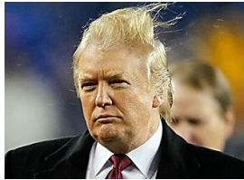
Trump's IQ Will Shock You Choice or Life