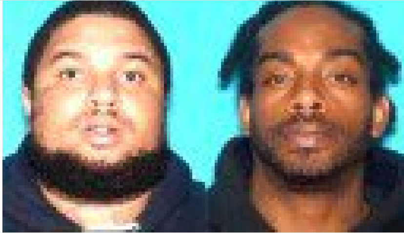
Filipina in Vallejo, Calif. kidnapped for ransom, still missing

Disclaimer: Comments do not represent the views of INQUIRER.net. We reserve the right to exclude comments which are inconsistent with our editorial standards. FULL DISCLAIMER