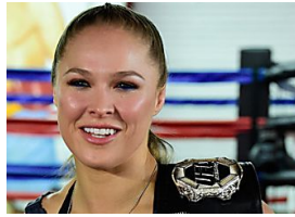
We Were Shocked When She Endorsed This Presidential Candidate