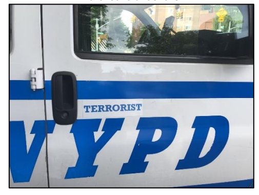
Vandalism of NYPD patrol vehicle