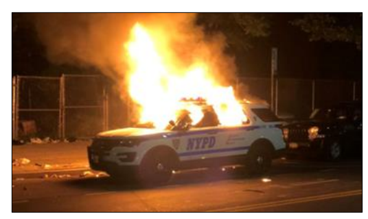
Burning NYPD patrol vehicle

unknown perpetrators broke the windows of a marked NYPD van in the 6<sup>th</sup> Precinct and poured an unknown liquid accelerant, setting the van on fire.<sup>6</sup> On July 29, a marked, unoccupied NYPD patrol vehicle in the 20<sup>th</sup> Precinct was set on fire in a similar manner.<sup>7</sup> The investigation into both incidents is currently ongoing. According to Operation SENTRY partner reporting, the day before a local protest in Perth Amboy, New Jersey, a social media posting offered individuals $1,000 for each patrol vehicle they lit on fire, as well as other incentives for assaulting police officers.<sup>8</sup>