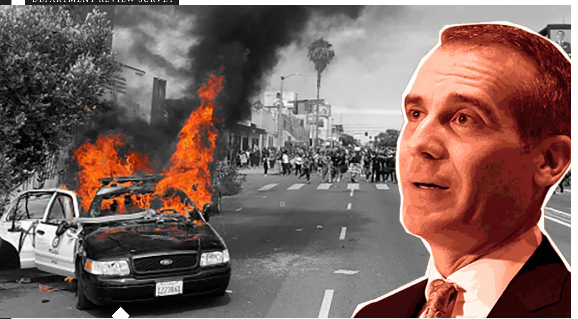
Los Angeles Mayor Eric Garcetti